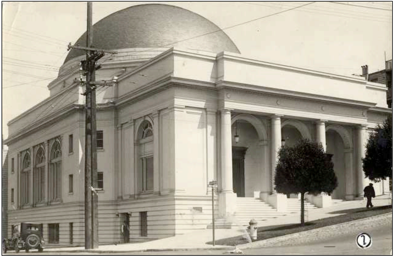
Second of Church Christ, Scientist, 655 Dolores Street, S.F. History Room Collection, AAB-1110, 09/27/30.